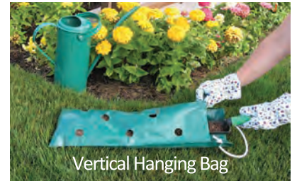
Vertical Hanging Bag

Nasturtium 'Jewel Mix' Dwarf Sweet Pea Morning Glory Purple Morning Glory Scarlet Marigold 'Sparky' Coleus 'Rainbow Mix'