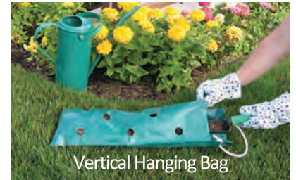
Vertical Hanging Bag

Nasturtium 'Jewel Mix' Dwarf Sweet Pea Morning Glory Purple Morning Glory Scarlet Marigold 'Sparky' Coleus 'Rainbow Mix'